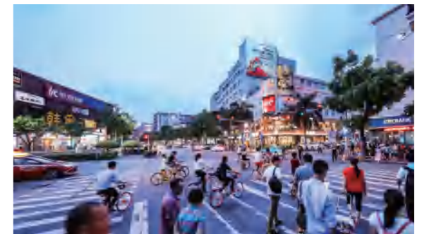
▲ 时代·远景大韩城 The Korea town