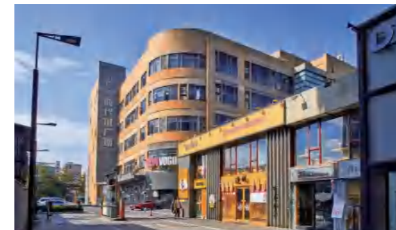
▲ 时代 TIT 广场 Times TIT Plaza